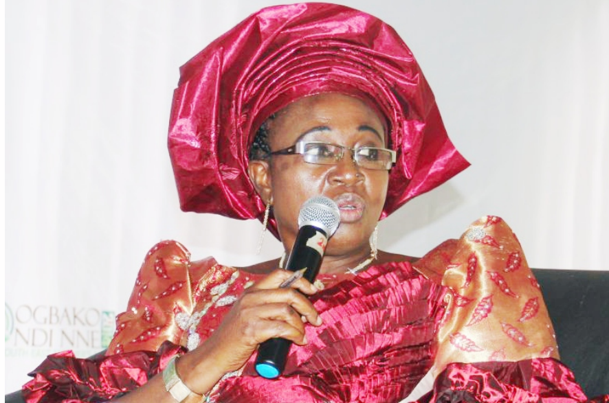
■ Mrs. Chinwe Nora Obaji, Former Minister of Education.

Former Minister of Education, Mrs. Chinwe Nora Obaji, has joined other Nigerians to pass encomiums on the Registrar, Joint Admissions and Matriculation Board (JAMB), for the successful conclusion of the just-concluded 2020 Unified Tertiary Matriculation Examination (UTME) as well as the great changes he had wrought in the